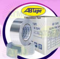
AB TAPE ALUMINIUM TAPE