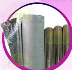
WOVEN METALIZING FOIL SINGLE & DOUBLE SIDE