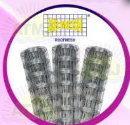
AB MESH WIREMESH/ ROOFMESH 3315 (Ready another type)