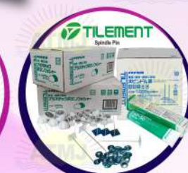
TILEMENT SPINDLE PIN, WASHER, & ADHESIVE GLUE