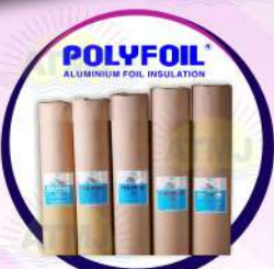
AB ALUMINIUM FOIL SINGLE/DOUBLE DS/FR (Ready another type)